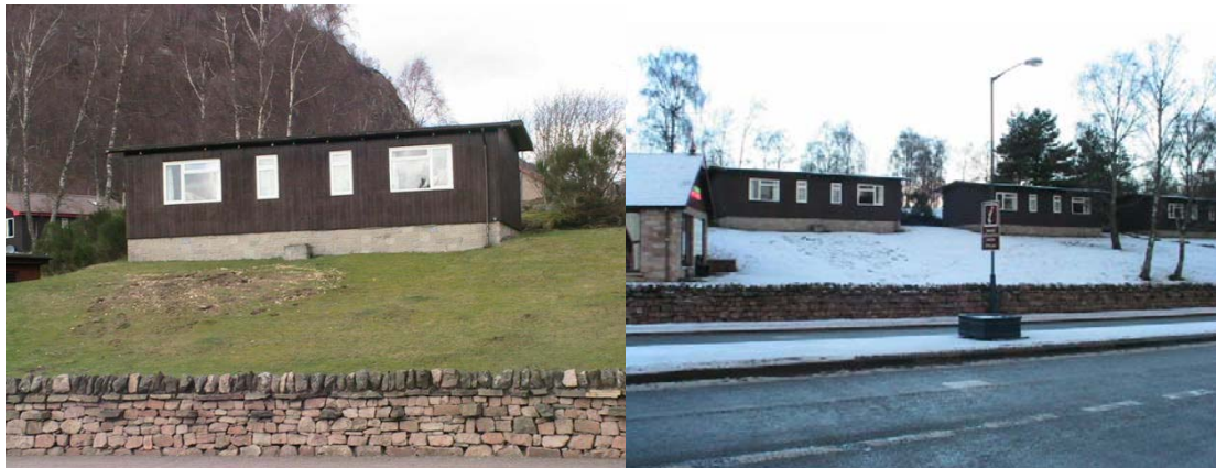
Fig 2 chalets proposed to be removed as part of redevelopment