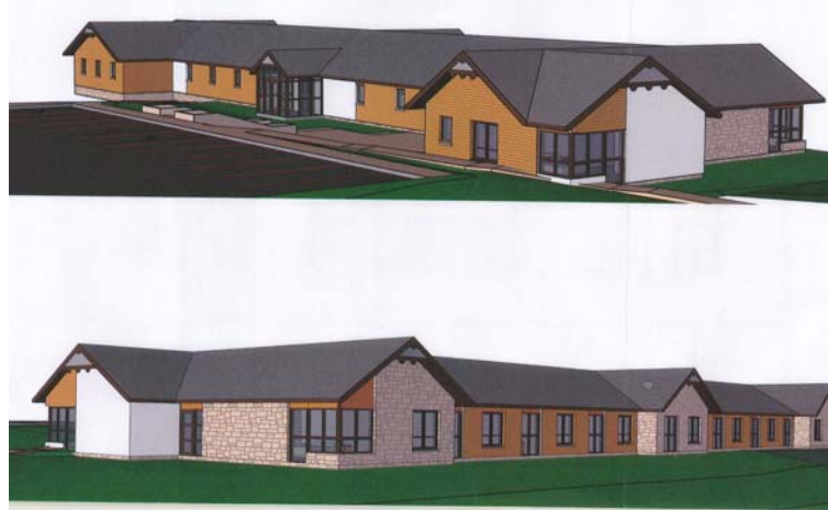
Fig 3 revised design proposals upper drawing shows rear elevation lower drawing shows front elevation to Grampian Road